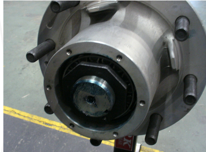
Assemble adjusting nut etc..