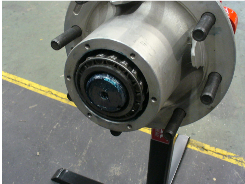
Insert outer bearing