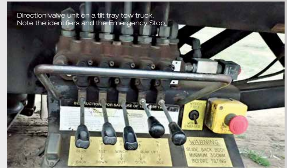
Direction valve unit on a tilt tray tow truck. Note the identifiers and the Emergency Stop.

Reservoirs are closed tanks that are usually made of steel or aluminium. Aluminium has about three times the heat dissipation capacity of steel and is lighter but is harder to fabricate. Heat dissipation is necessary because the hydraulic oil heats up as it does work. The oil return port must be low down to avoid frothing the oil in the tank. The oil return port should also be away from the intake port to avoid circulation of hot oil. The tank will need a breather to cope with oil level changes. Keeping the oil topped up will minimise the air space and therefore minimise the condensation moisture that can get into the oil. Contamination is the greatest enemy of hydraulic systems. An unclogged filter must be in the low-pressure pump intake. A suction strainer should also be installed in the reservoir to catch larger debris. The filter should be placed before the cooler to prevent clogging. Safety Valves must be fitted